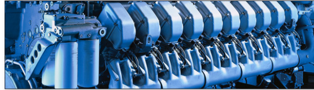
2 and 4 Stroke Engines